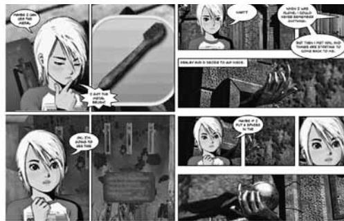
Figure 1. Sample Comic Book Pages (Top), Book Page (Left), Nintendo DS “Pages” (Right)